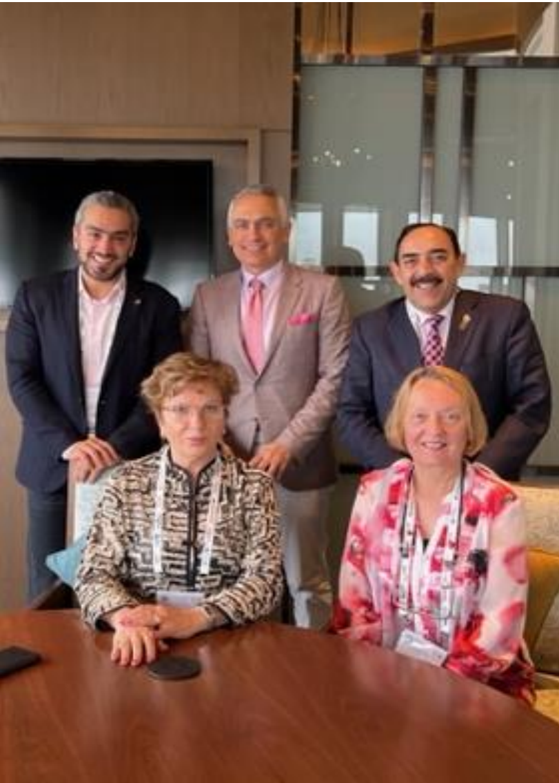
ISD Executive Committee Meeting at the World Congress of Dermatology in Singapore.