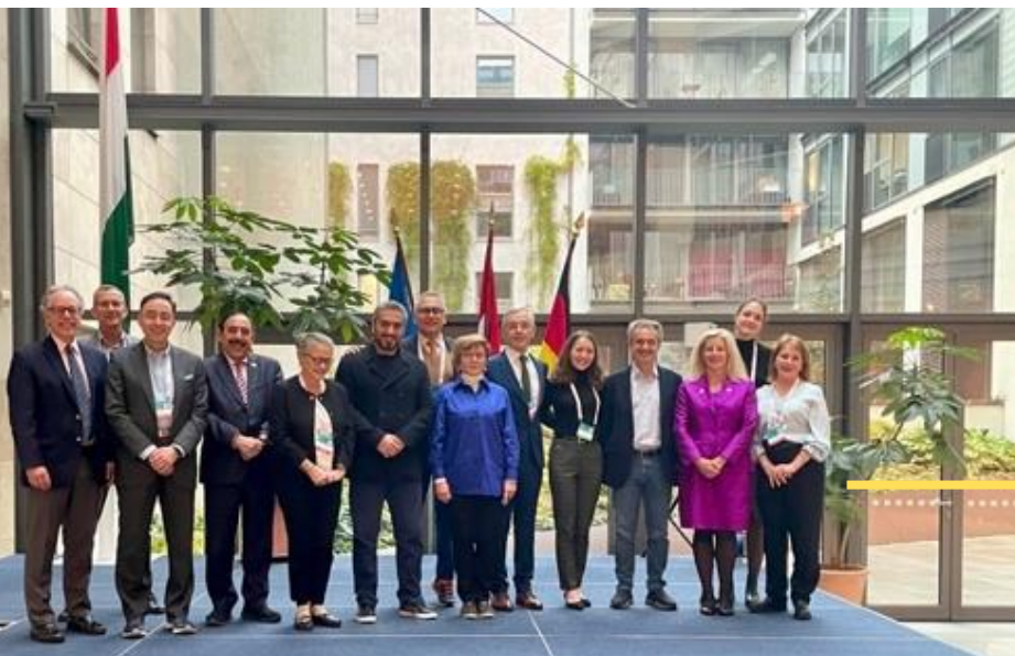
Joint meeting of the IJD section editors and the Executive Committee at the Hungarian Embassy in Berlin.